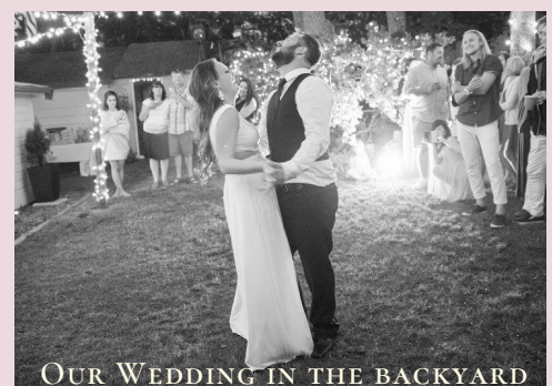
OUR WEDDING IN THE BACKYARD

We love the area as its so close to so many amenities, family members and friends.