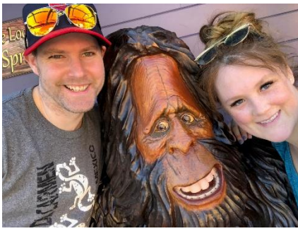
Weekend in Harrison Hot Springs