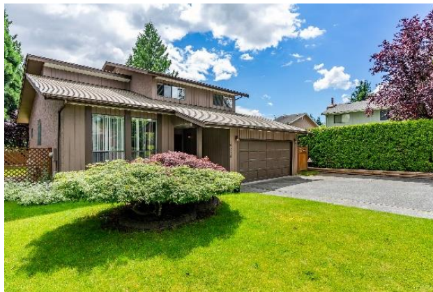
Our Beautiful Home