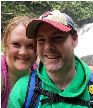
Hiking at Golden Ears

Your child will be encouraged to discover and develop their interests and emotions, whatever they may be. They will have the opportunity to make their own life choices, with every bit of support and guidance we can provide.