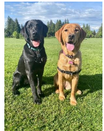
Our two pups