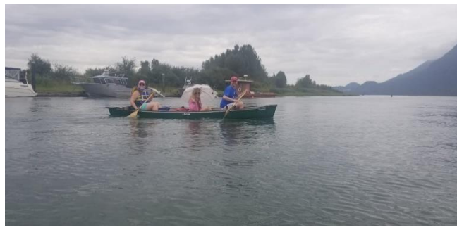
Canoeing on Pitt River