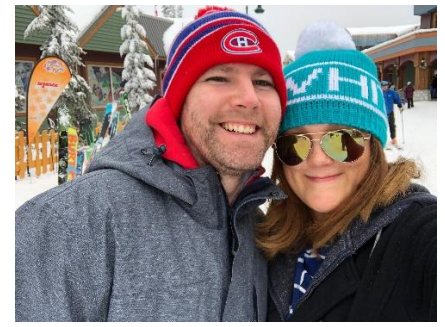
Mini Vacation to Big White