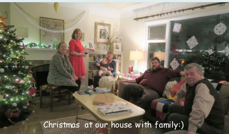
Christmas at our house with family:)