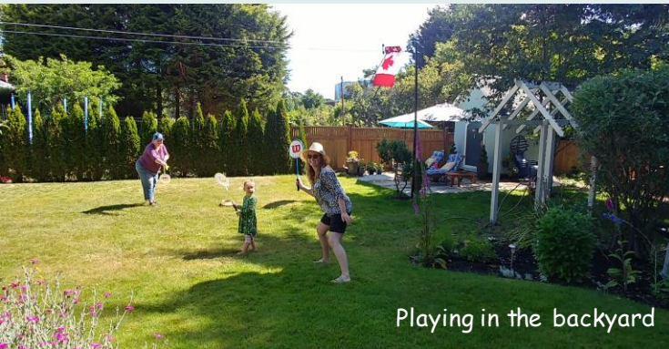
Playing in the backyard

We are really looking forward to making a child's life memorable and special. Our home has a big safe yard for kids to play in, including a treehouse and a garden for growing and exploring. We are lucky to live in Victoria, BC, one of the most beautiful places in Canada. Our neighborhood is full of schools and families. There is a wonderful sandy beach and community parks and playgrounds a short walk away. We often take our niece to play at the beach, year round.