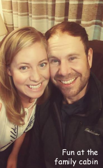
Fun at the family cabin