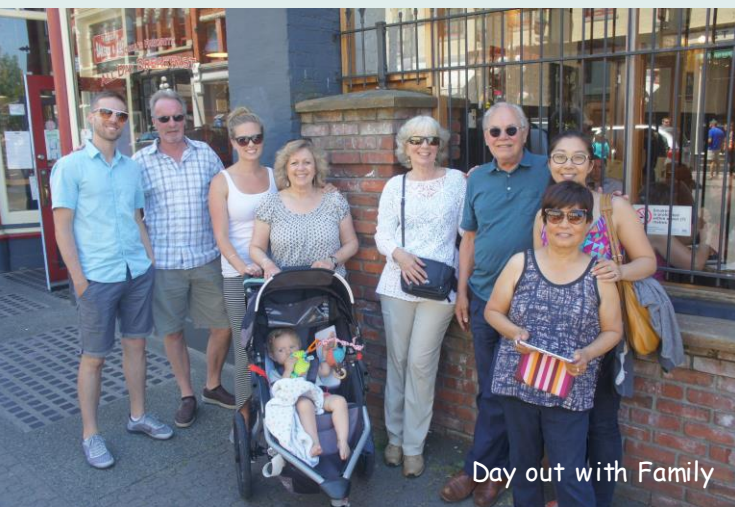
Day out with Family

We really enjoy spending time with the little ones in our lives and feel that we would be very good parents. Our ideas about parenting include: establishing the healthy routines of family life; simple things like playtime, dinner around the table, story time cuddles, tooth brushing, bath and bedtime are all opportunities that nurture a child's development.